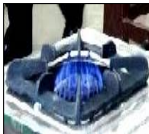
Fig 4 BioGas Burner

Biogas contains high volume of methane (CH 4 ) and some impurities like carbon dioxide (CO 2 ), hydrogen sulphide (H 2 S) etc. The presence of hydrogen sulphide (H 2 S) and carbon dioxide (CO 2 ) becomes harmful due to their toxic nature. Due to its corrosive nature, hydrogen sulphide (H 2 S) highly affects metallic parts of the container and also produces sulphur dioxide (SO 2 ). So the removal of hydrogen sulphide from biogas is essential for safe storage and supply in pipeline. The removal of carbon dioxide and hydrogen sulphide from the biogas is done by the scrubbing technology. Water scrubbing technology is a type of chemical scrubbing technology. It involves the use of pressurized water as an absorbent.