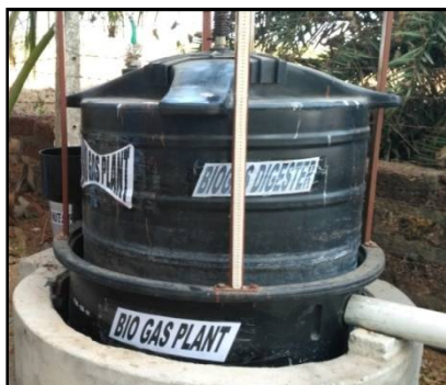
Fig 2 Biogas Digester

Biogas is produced from the food wastes, kitchen wastes, animal excreta and some other organic wastes. These organic wastes are collected from hostels, hotels & also from home. Then the organic wastes are allowed to digest by the bacteria in the process known as anaerobic reaction. The food wastes are collected from the canteen and the slurry being prepared by water with right proportion. Then the slurry is fed to the digester and facilitates the process of generation of gas in the absence of oxygen.