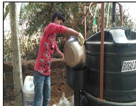
Fig 3 Slurry prepared fed to Digester